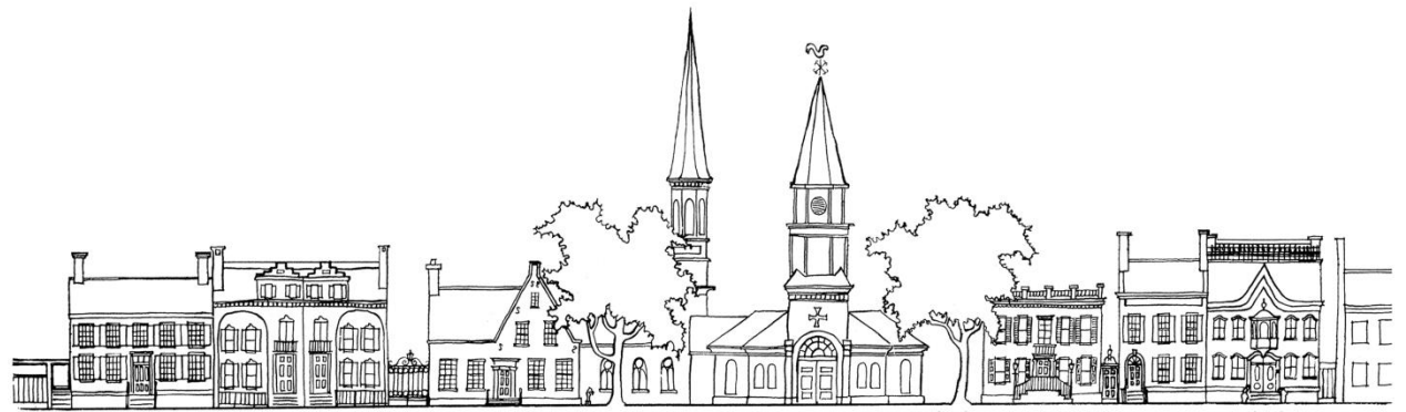
Drawing TM Stockade Association | Map courtesy Stockade Association

Once ready, search izi.TRAVEL for the Schenectady tours and follow instructions to start. At start, each activates recorded narrative and images as you proceed with a guided walk. The map to the right gives each tour's starting location.