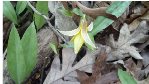
Trout lily, 5/2/14

This 6-acre public nature preserve offers relaxed walking along a gentle path to arrive at a sweeping view overlooking the Mohawk River from along the cliffs of Clifton Park. The entire trail system is about one-quarter mile. The parking lot to the picnic area / Scenic Overlook is about 800 feet.